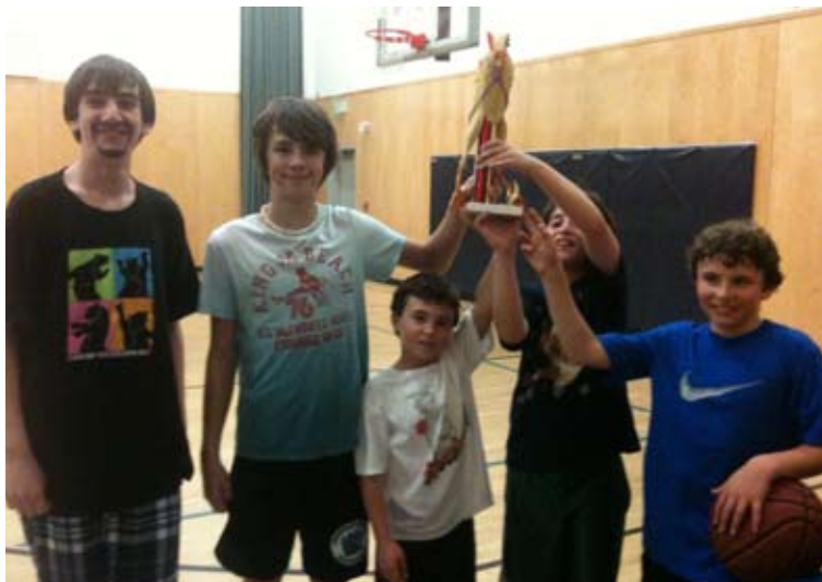
Basketball Champions from a recent Youth Group event