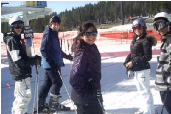
Annual Sababa Ski and Snowboard Trip