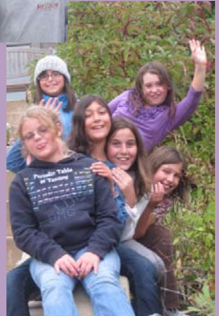
Top: Our 6th graders lend a hand at Urban Adamah for the Mitzvah Corps Right: Students in our Kadima program enjoying time together Bottom: Having a good laugh at Chug Mishpachah