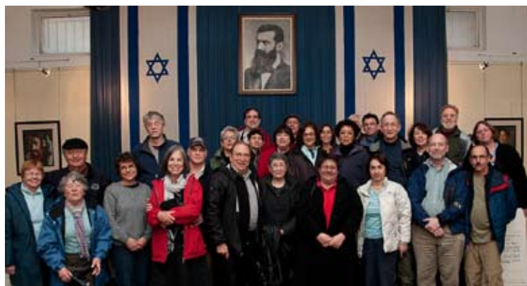
Beth El Israel Trip 2008 - Independence Hall

CONGREGATION BETH EL 1301 Oxford Street Berkeley, CA 94709-1424